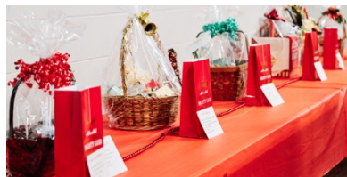
Fun - Gift Baskets